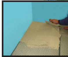
6. Cover Plastic Ply with Nicobond Rapidflex adhesive