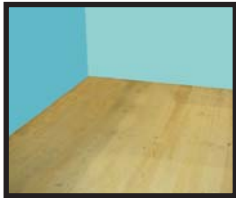
1. Ensure floor is clean and dust free.

A revolutionary solution to fixing tiles and Natural Stone to timber floors. Prevents problems of damage to tiles by reducing the effects of timber shrinkage, warping and rotting. Eliminates the need to install thick sheets of Marine Grade plywood (min 15mm) or similar over-boarding products.