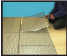
5. Cut using scissors