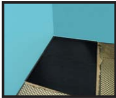
7. Fix tiles