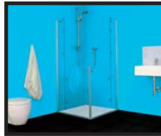
9. Finished room