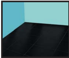
8. Grout using Nicobond Rapidflex grout