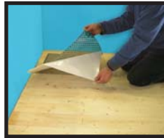
3. Remove release paper