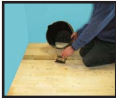
2. Prime timber and allow to dry